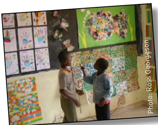
Same Difference workshop, AMASOURD (School for deaf and hearing impaired children), Mali, June 2006