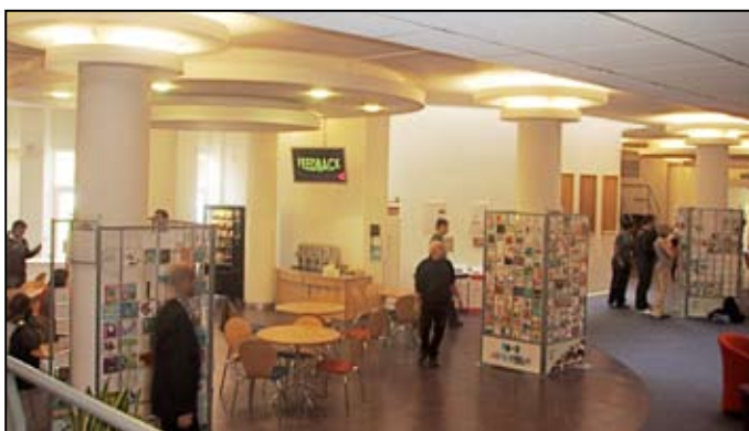
Same Difference , Cranfield University, May 2010