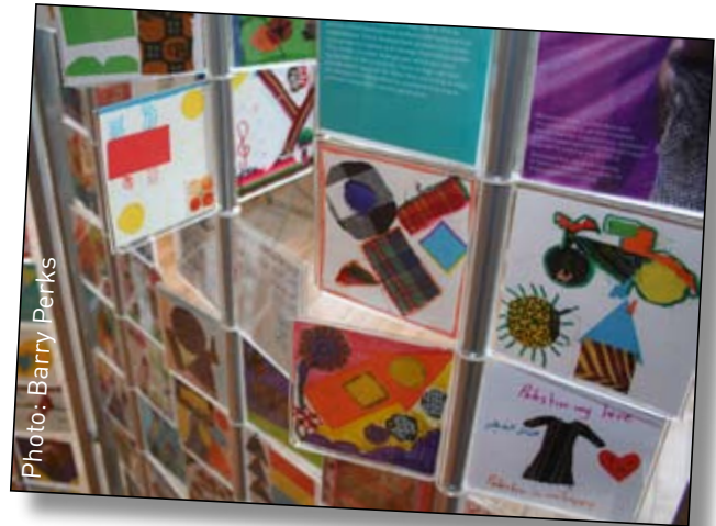
Same Difference - exhibition detail

The self contained exhibition includes aspects of installation, sculpture and 2 dimensional work. This consists of 10-12 inter-linking free-standing frames making the exhibition flexible to the space available at each venue. Each frame measures approximately 1m x 2m and holds 72 pieces of double sided artwork. Being self-contained the exhibition can be shown alongside other exhibitions and promotions. The exhibition also includes text and photographs of the children involved and the countries in which they live.