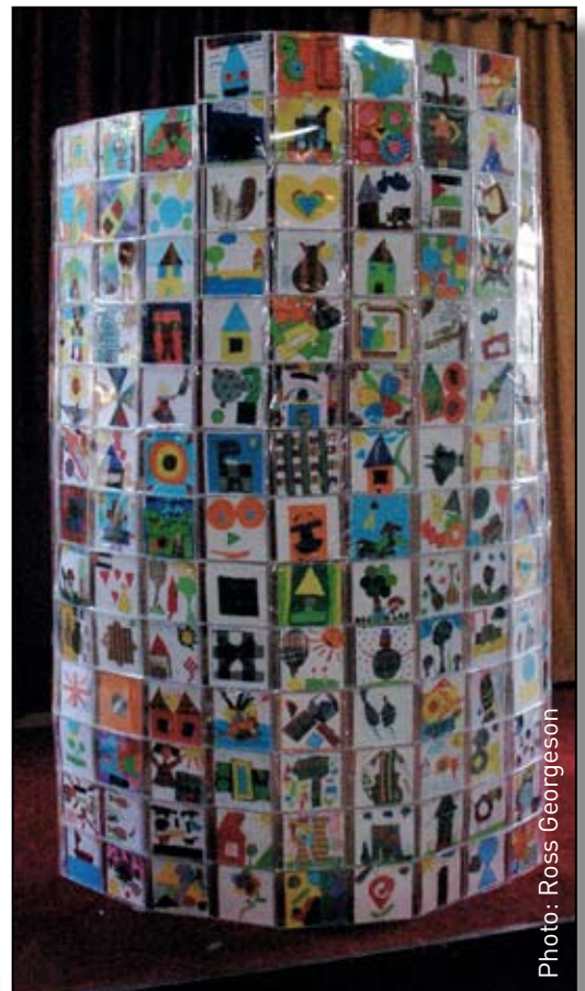
Sculpture created from Same Difference artwork exhibited at Arts and Crafts Village, Palestine, 2006