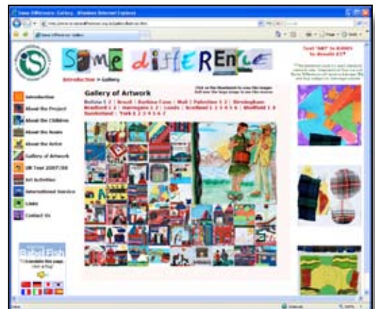
Screens from the Same Difference website

The website will be re-developed in 2010/11 to allow visitors to access our interactive curriculum resources and upload artwork