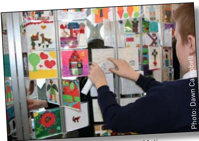
Reading a Same Difference card from Mali, City Art Gallery, Southampton, March 2008

Same Difference is a unique and project which helps to improve the lives of these disadvantaged children and their parents, carers and teachers. The children gain in confidence, as well as learn about other countries and cultures taking part, and be given a chance to express themselves to the wider community through the exhibition of their work.