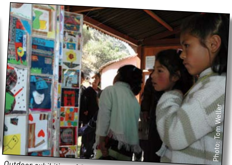
Outdoor exhibition of Same Difference artwork at Museo Kusillo, La Paz, Bolivia, June 2006