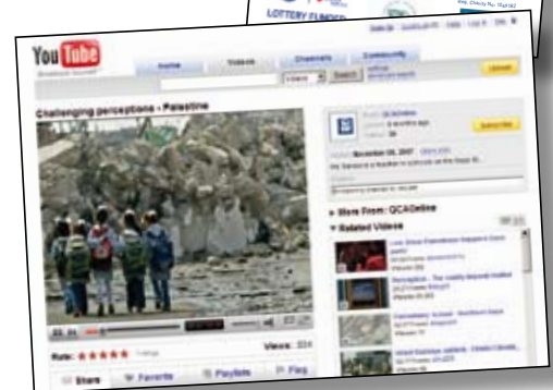
Still from the Same Difference Palestine case study on the QCDA YouTube website