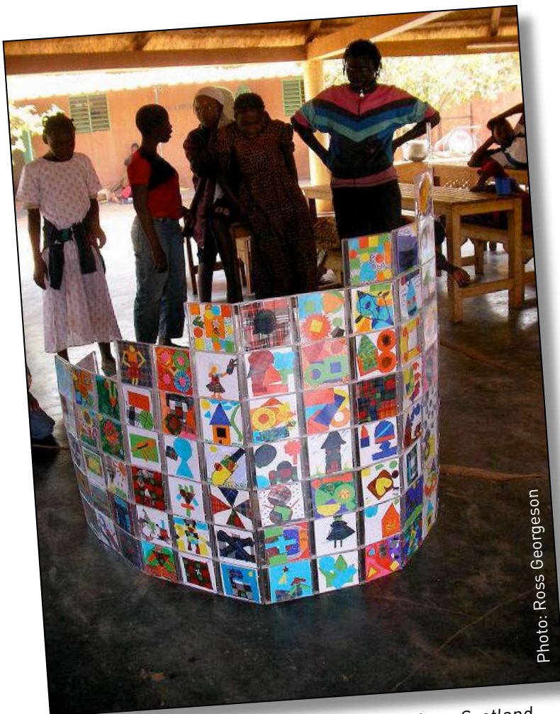
Sculpture created from artwork by children from Scotland and Burkina Faso exhibited at the AMPO orphanage in Burkina Faso, January 2006