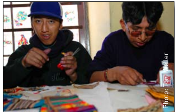
Same Difference workshop, Fundacion Nueva Dia (Resource and Education Centre for Child Workers), Bolivia, June 2006

In 2008, children from Belarus (the first in Eastern Europe) and in 2009 children from Qatar , Ghana and Columbia took part in a Same Difference workshops,