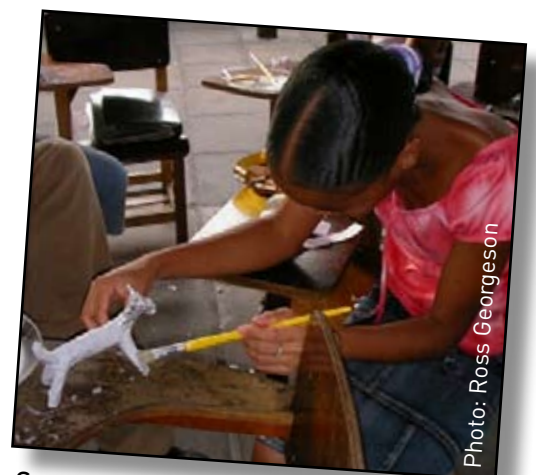
Same Difference workshop, Grupo Ruas and Pracas, Brazil, November 2006