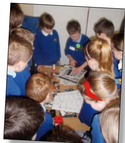
Children during a Same Difference workshop at Bedale High School's 'One World Day', January 2010